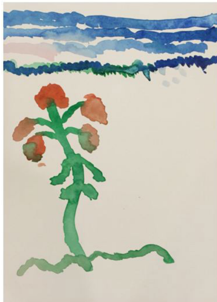
Figure 1: The Lone Apple Tree

Persons in the early stages of dementia commonly depict images reflecting fear, depression, anger, despair and concern. The more cognizant he or she is about the disease, the more apt he or she is to take on the identity of the disease itself, feeling as if they are losing their sense of self. Through the counseling process of validation, cognitive-behavioral therapy (CBT) and mindfulness practice taken from dialectical- behavioral therapy (DBT), tensions may ease and the reclaiming of the self is reinstated.